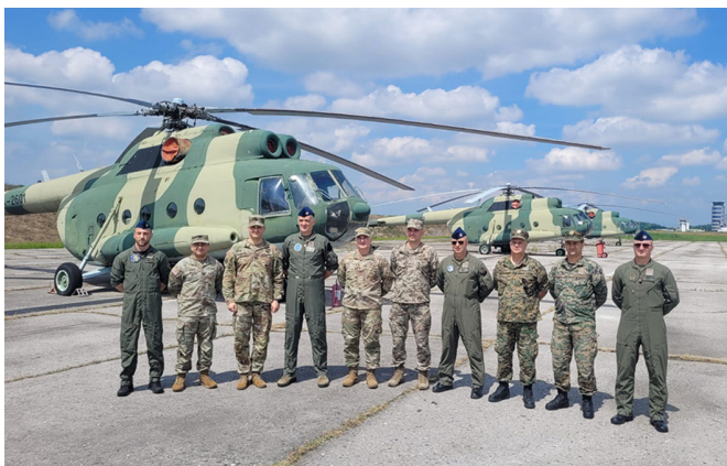
A team from DSCU's DIILS recently traveled to Bosnia and Herzegovina to conduct a seminar on Human Rights and the Law of Armed Conflict with members of their military.